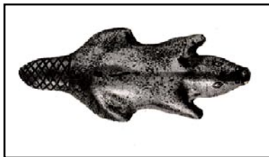
Trade Silver – The Beaver