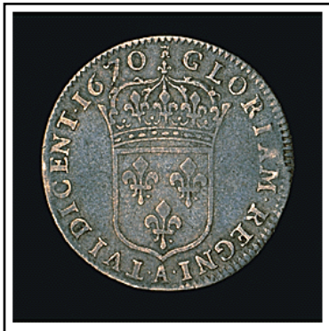
New France, Louis XIV, 15 sols, 1670, reverse