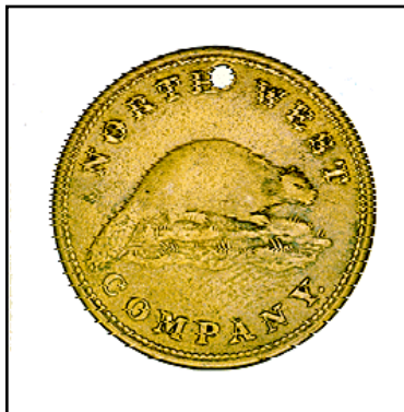
North West Company Brass Token, 1820

The early European settlements began on the banks of the St. Lawrence River. Soldiers and sailors, sent over by the king of France, were the first people to reach the shores of this new land. It was already known that this new territory was rich in resources such as timber, fish, and beaver, whose pelts became extremely popular in Europe. While gold and diamonds were yet to be discovered, they were, however, on the minds of both those voyaging across the ocean and those who had sent them on the trip. Knowledge of these commodities came from the earliest European explorers, people such as John Cabot, Jacques Cartier, and Samuel de Champlain. ( For more information, please see: www.civilization.ca/vmnf/vmnfe.asp and click on Explorers.) In fact, the early European explorers were sent for the specific purpose of seeking out whatever riches could be found and sent back to the respective king or queen, and to claim territory for the crown. Nobody thought about the people who, for thousands of years, had inhabited and owned the lands we now call Canada.