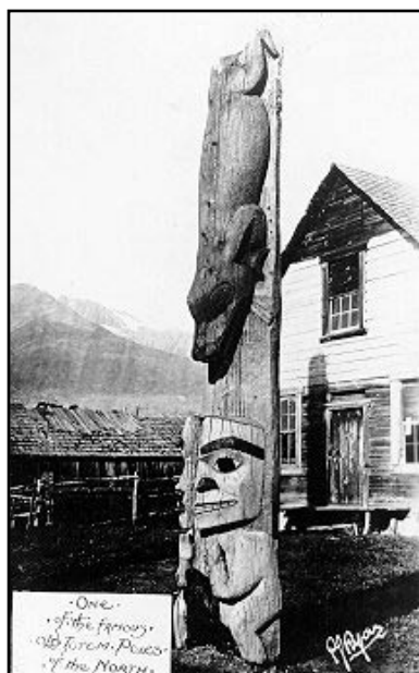
"One of the Famous Old Totem Poles of the North." -nd.