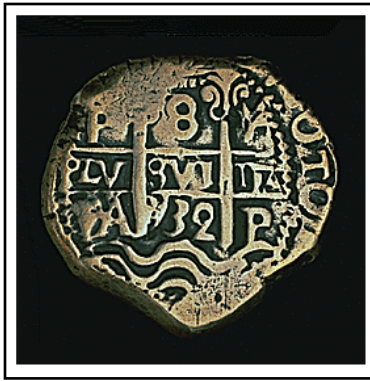
Latin America, Philip V, 1732 silver cob