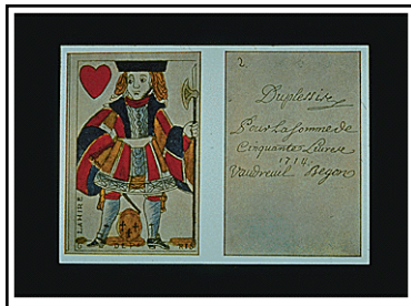
Reproduction of the 1714 issue of New France's playing card money

solution, the practice became widely accepted within the new colonies. When troops were to be paid, for example, senior officers would write the denomination on the back of the playing card, displaying its value. To the merchants and the general population in the settlements, the playing cards became accepted currency.